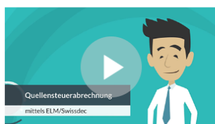
Elektronische Übermittlung der Daten (ELM) - Deutsch.