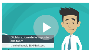
Trasmissione dati da un programma salariale (ELM) - Italiano.