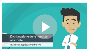
Uso senza un programma salariale - Italiano.