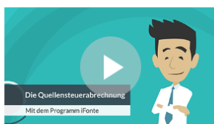
Nutzung ohne Lohnprogramm - Deutsch.

Here is the tutorial in different languages, which explains iFonte in more detail: